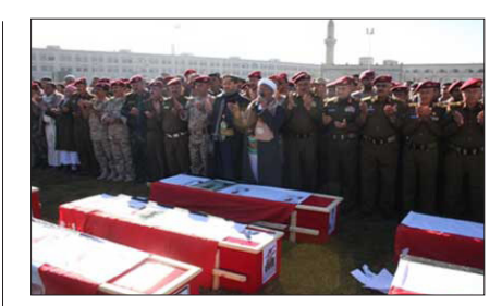
Is Yemen really winning its fight against terror?